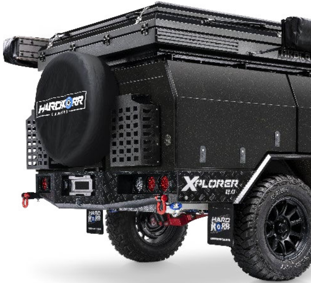
Overseas model shown. Subject to change without notice.

Purposely designed to fit in the garage, the Shorty measures up at just 1980mm high meaning that, after a trip, it can be quickly unpacked, charged up, and stored more securely and conveniently, within the comfort of your own home.